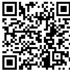
P3 QR Code

Students should also report to a staff member any person that they see who looks suspicious. As a community, we don’t want to live in fear, but we do encourage all members to trust their gut feelings and instincts and report when something is concerning.